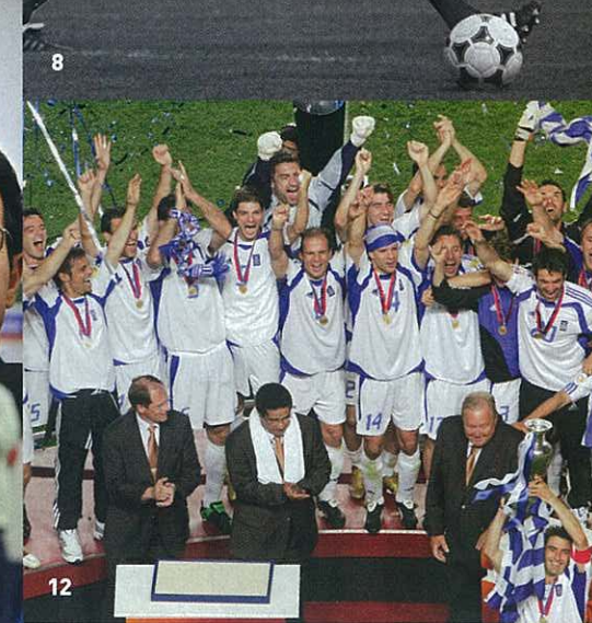
11 England crashes out of Euro 08 12 Greece shocks Europe in 2004