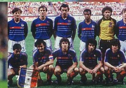
6 The expressive Paul Gascoigne 7 France: champs in '84 8 Platini, the star of Euro 84 9 '85 vintage Tyler 10 Fabio Capello: the man to rescue England?